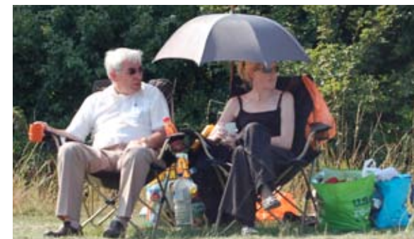
How to look after your rider - Do you think he wanted something? (from the Gwyneth Holland handbook)